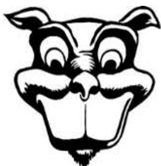
Origin, "Back to Bunyip 1959"