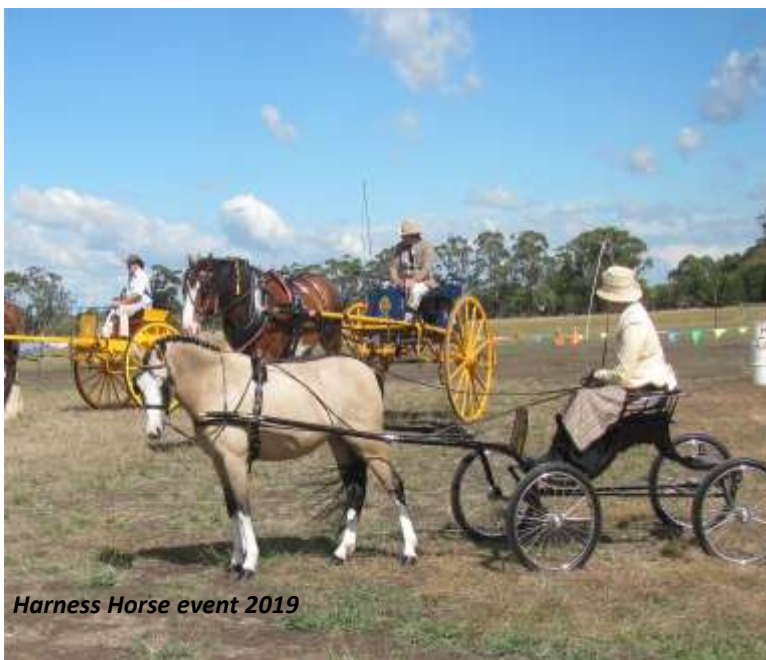
Harness Horse event 2019

On Bunyip show day there are competitors from areas such as Bairnsdale ,Geelong ,Bendigo also from our own area of Gippsland all presented to our Judges for the nod to receive the Blue ribbon. The presentation of the riders and animals is always very high so the horse or pony being shown takes the judges eye and is given a closer inspection and their obedience ,manners and paces are assessed.