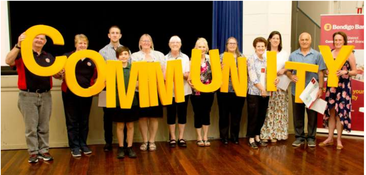
A very happy group of Grant recipients